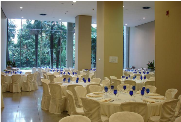
Figure 3 INFOCOM - Turin

From 14th to 19th of April, INFOCOM was held this year at Lingotto Conference Centre in Turin, Italy (Fig. 3). Sören Finster presented the paper “Elderberry: A peer-to-peer, privacy-aware smart metering protocol”, a joint work with Ingmar Baumgart, at the Workshop “Communications and Control for Smart Energy Systems”. The paper addresses privacy issues in Smart Metering and provides privacy through cooperation of Smart Meters using a peer-to-peer overlay.