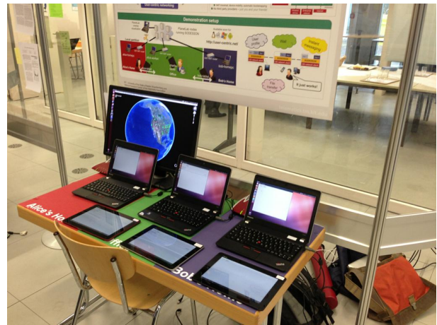
Figure 1 NetSys 2013

During the conference NetSys 2013, Dr. Ingmar Baumgart and Fabian Hartmann presented their demonstrator "User-centric networking powered by SODESSON" (Fig. 1) which enables a decentralized social network by utilising only the users' devices and allows transparent data transfer by face-to-face meetings if internet connectivity is not available. If a user possesses multiple devices, they get synchronized automatically.