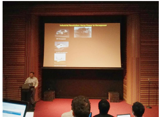
Figure 4 eEnergy - Berkeley